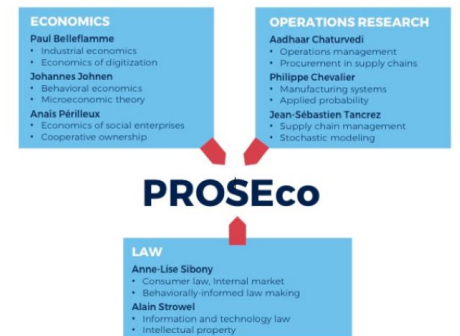
Figure 1. Competences of the PROSEco research team

Gun Control, Abortion, Climate Change, LGBTQ Rights, Rights of women Insufficient and inadequate